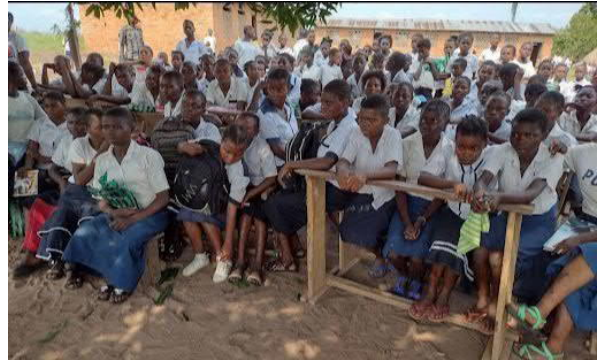
Pictured: An agricultural association and an assembly of Tshimbundu students.