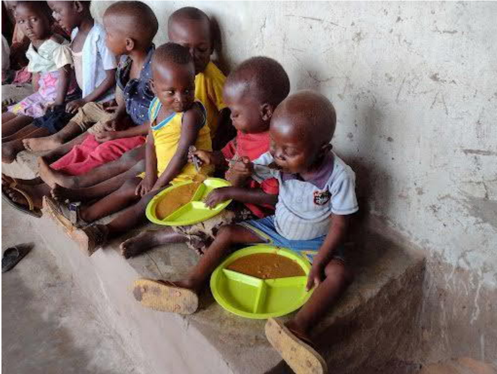
Some of the children Butoke cares for at its orphanage and feeding centre in Tshikaji.